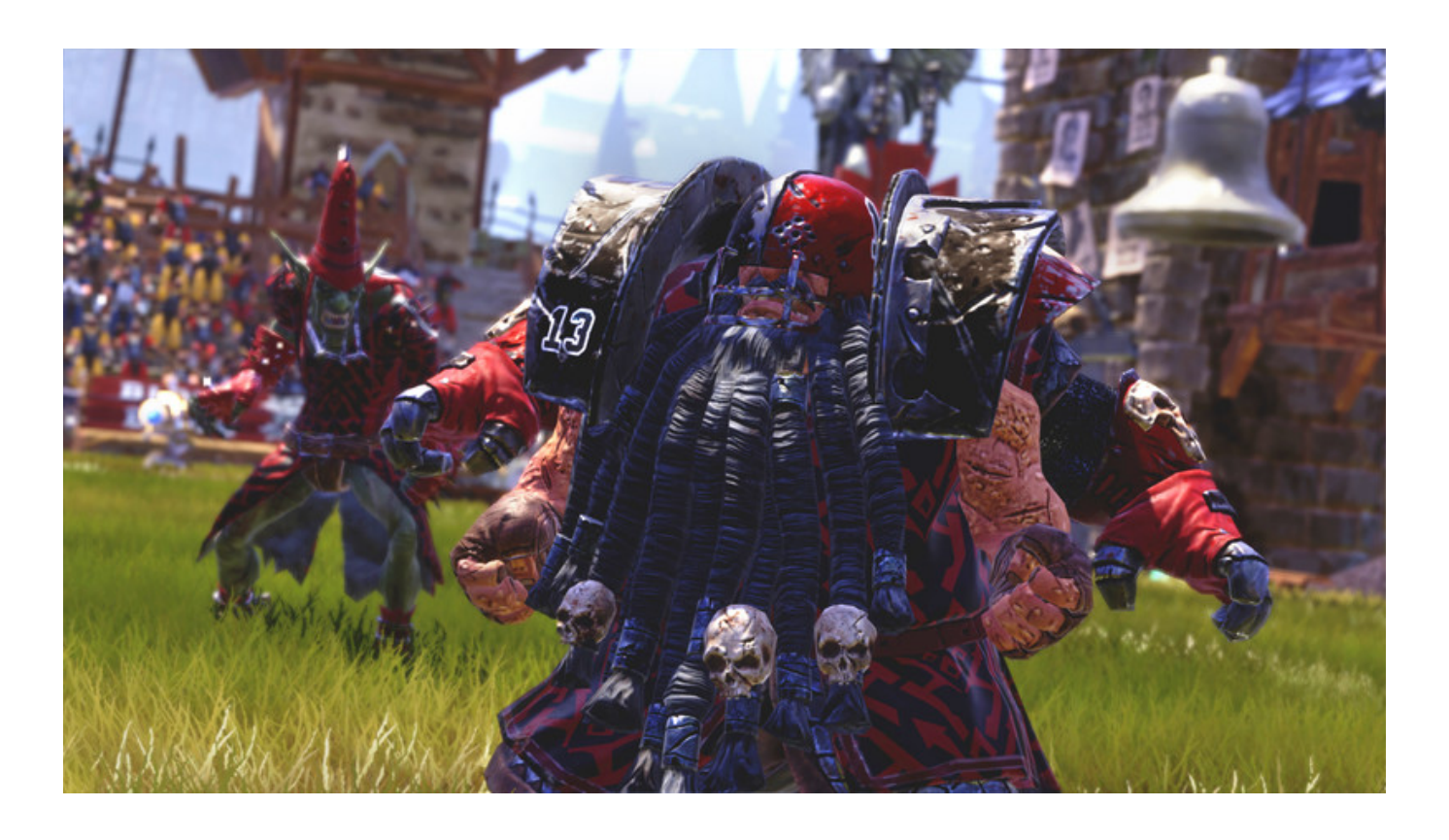
Blood Bowl 2 - Chaos Dwarfs Crack And Patch

Download ->>->> <a href="http://bit.ly/2NFCESu">http://bit.ly/2NFCESu</a>